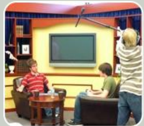
Broadcast Journalism 120 and Digital Sound 120 Developing new methods of delivering curriculum over distance