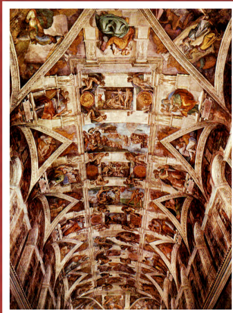
CEILING OF THE SISTINE CHAPEL