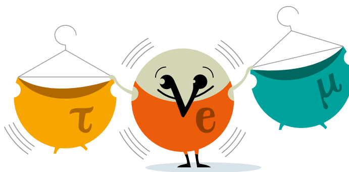
Torn between identities – tau-, electron- or muon-neutrino?

The hunt was on – deep inside the Earth in gigantic facilities where thousands of artificial eyes waited for the right moment to uncover the secrets of neutrinos. In 1998, Takaaki Kajita presented the discovery that neutrinos seem to undergo metamorphosis; they switch identities on their way to the Super-Kamiokande detector in Japan. The neutrinos captured there are created in reactions between cosmic rays and the Earth's atmosphere.