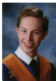
Tyler Kingston C.I. Road, NB