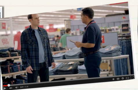
Ship My Pants (KMart)

If you shared any of these links, you were part of a new phenomenon in advertising: full-length advertisements that consumers choose to distribute, at their own cost. You can think of this as the digital version of people paying extra to wear clothing that featured a company's logo.