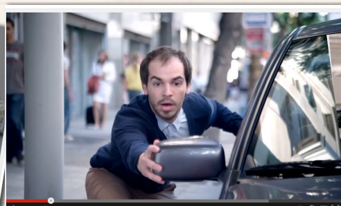
Baby and me (Evian Water)