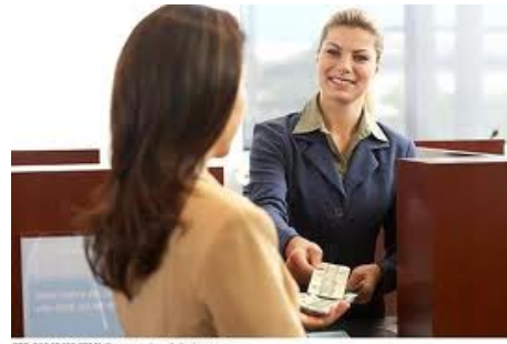
Banking that is done with the help of a Teller.