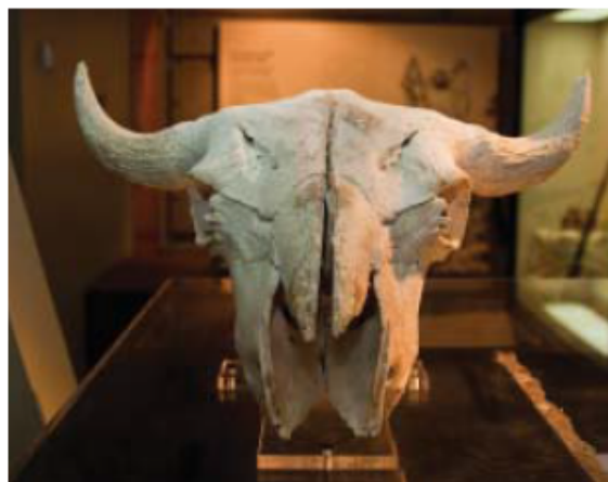
Buffalo skull display, Head-Smashed-In buffalo Jump Visitor Centre, near Fort McLeod, Alberta

Head-Smashed-In Buffalo Jump in southwestern Alberta is recognized as the best example of a buffalo jump in North America. The oldest bones unearthed at the site had 49.5% of the C-14 left. How old were the bones when they were found?